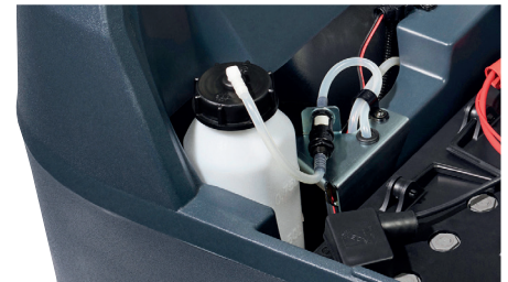
Optional detergent mixing system (allows for flexible detergent setting or water only cleaning).