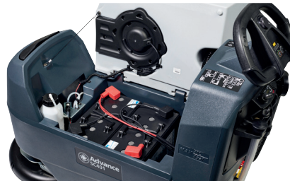
SilentTech™ sound insulated vacuum motor delivers 60 ±3 dB(A) in Quiet Mode for noise sensitive environments.