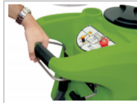
BRUSH CONTROL WITH AUTOMATIC DELAYED STOP