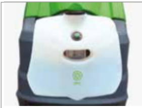
SEPARATE DETERGENT DOSING SYSTEM (OPTIONAL)