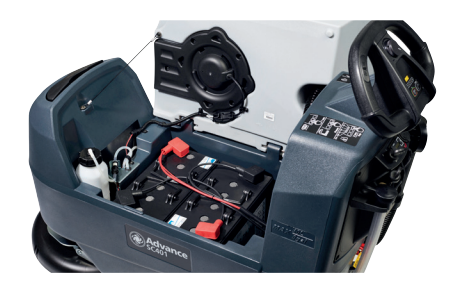
SilentTech<sup>™</sup> sound insulated vacuum motor delivers 60 ±3 dB(A) in Quiet Mode for noise sensitive environments.