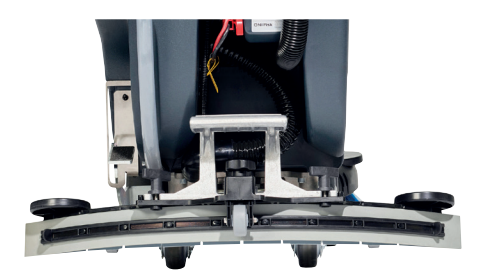
Patented squeegee blade system makes maintenance fast and simple through blade flipping – four wear edges.