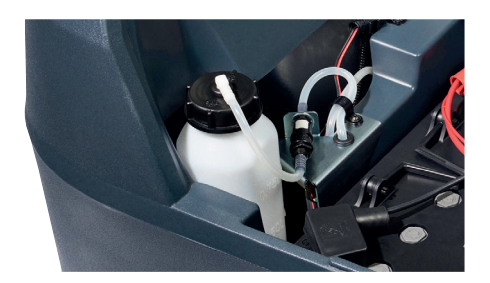
Optional detergent mixing system (allows for flexible detergent setting or water only cleaning).

Hospitals and Healtcare Facilities Grocery Stores Restaurants Convenience Stores Restaurants Retail Outlets