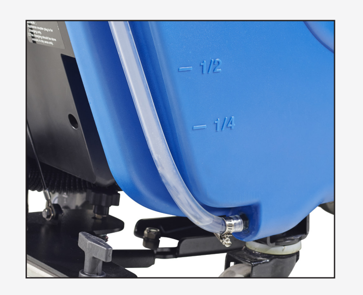
4. Check the water level indicator on the right side of the machine. Add appropriate chemical.