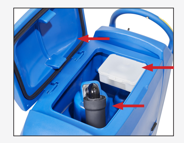
4. Daily: Inspect and rinse the ball float cage and the foam filter, debris catch cage and inspect and clean the gasket as required.