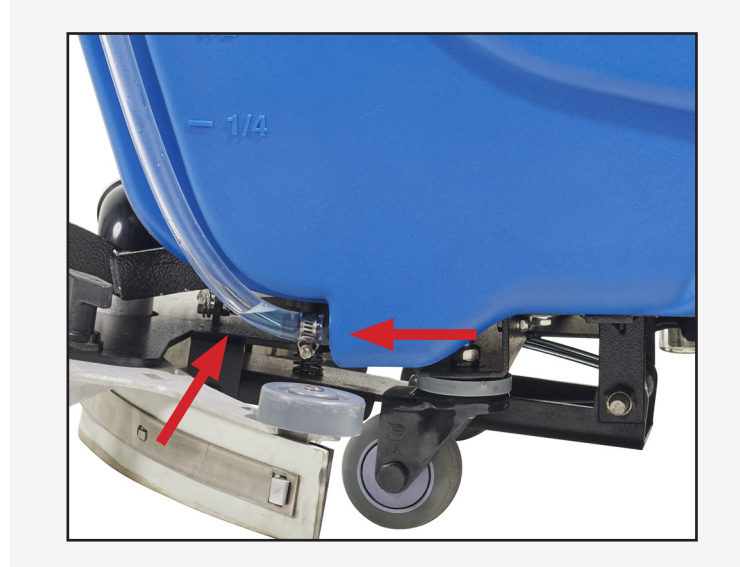
2. Daily: Empty the clean water tank using the solution tank drain hose and sight tube.