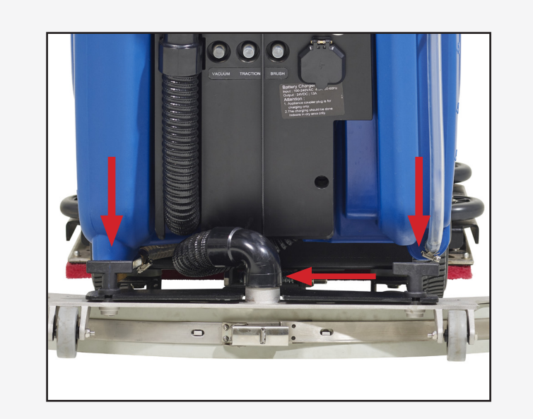
2. Install the squeegee using the thumb nuts. Attach squeegee hose.