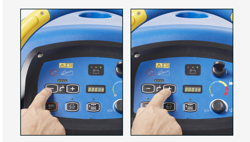
12. Press the + or – solution buttons to increase or decrease the water flow rate and to turn water off.