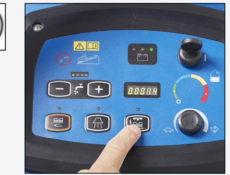
13. On disc machines, the brush/pad holder can be removed automatically.Raise the deck and press the click off brush button.

Nilfisk, Inc. 9435 Winnetka Avenue North Brooklyn Park, MN 55445 Phone: 800.253.0367 Fax: 800.825.2753 www.clarkeus.com