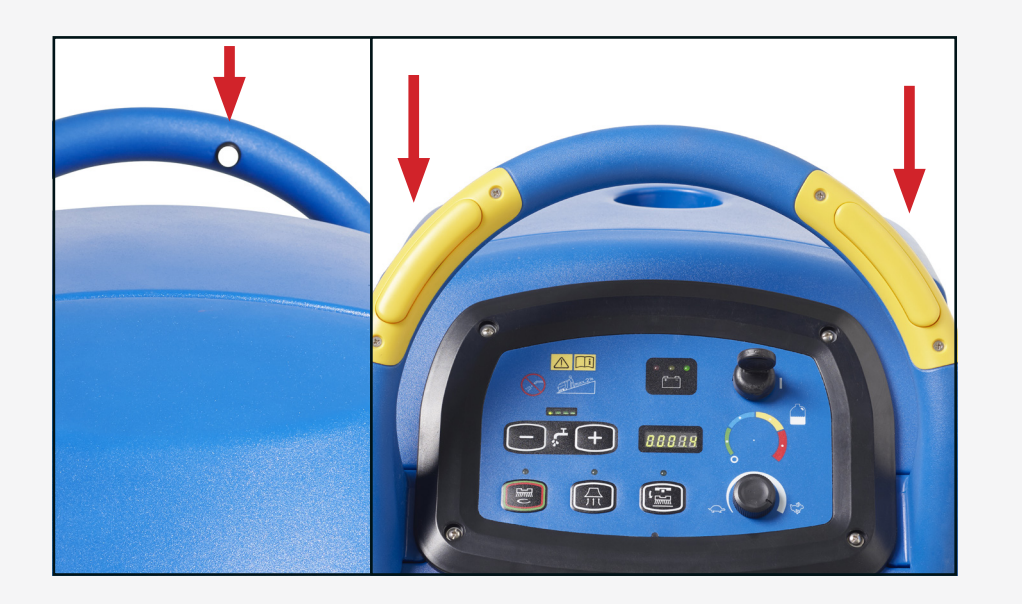
11. Pressing either yellow palm buttons and the white reverse button together will put the machine into reverse.

10. Use the rabbit/turtle knob to control the speed.