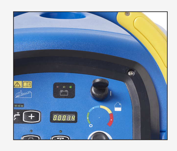
1. Turn on the key and verify there is enough battery power to complete the work. Charge batteries as required.