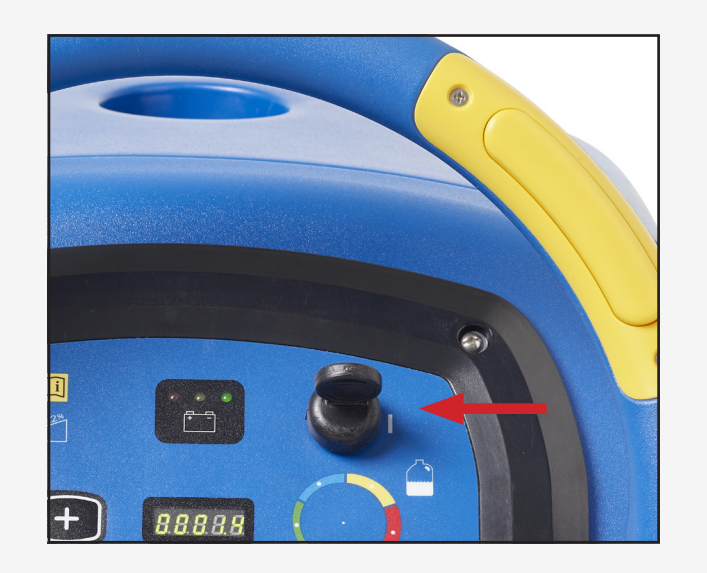
1. When scrubbing is complete, turn off the key and perform the following maintenance.

Operating guidelines Clarke CA60 automatic scrubbers