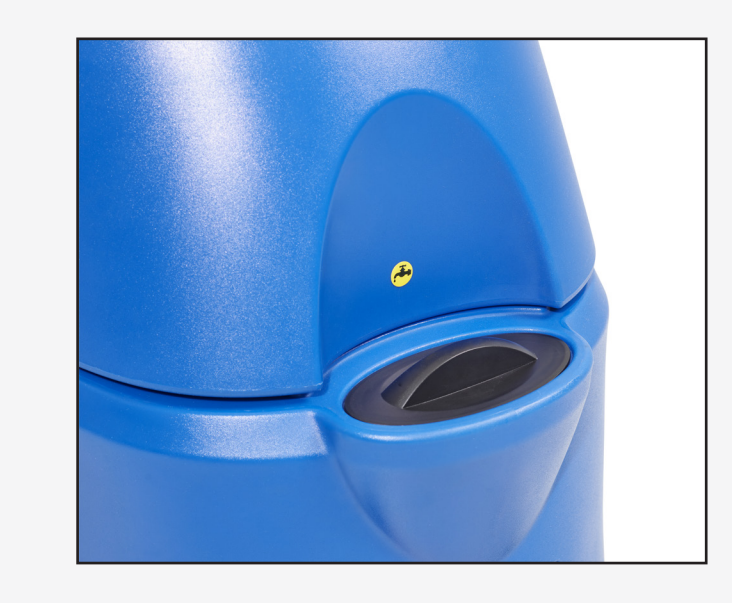
3. Remove the black cover on the front and fill to desired level. Machine holds 16 gallons/61 liters maximum.