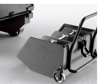
Wheeled hopper with optional mini containers