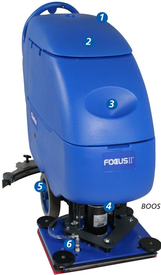
BOOST ® L20 Shown